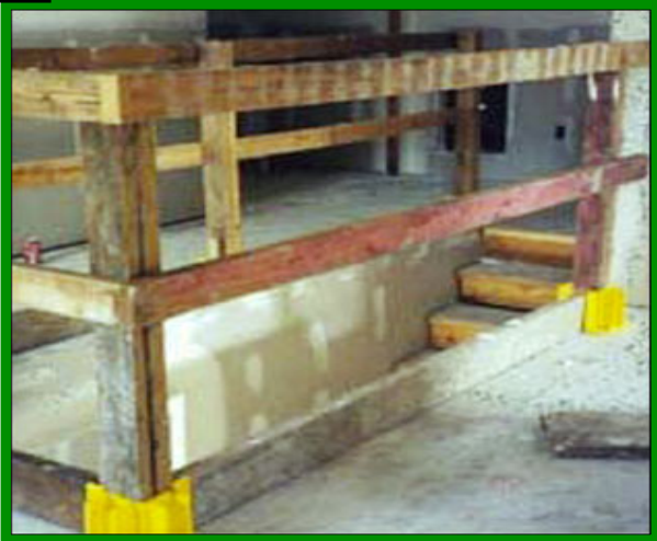
Guardrails are especially important in protecting against falls around stairwells and other floor openings.