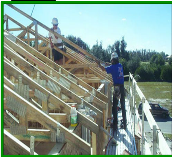
Workers using an exterior bracket scaffold to install roof trusses.