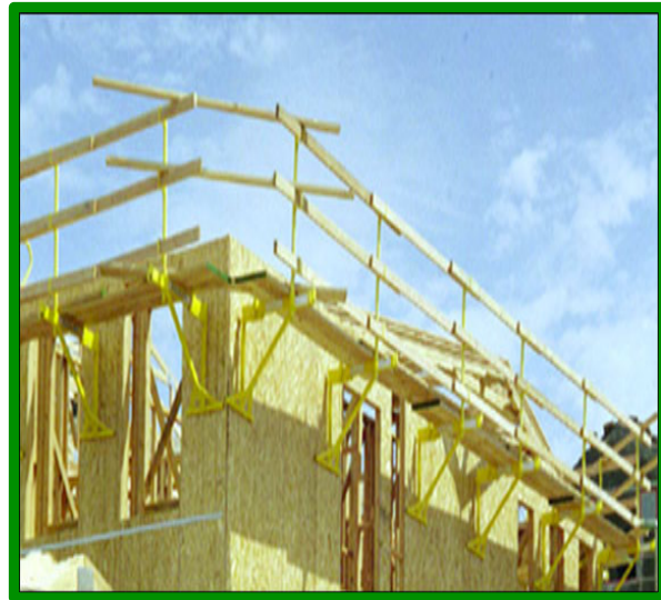
A scaffold rigged for installing floor joists and floor trusses.