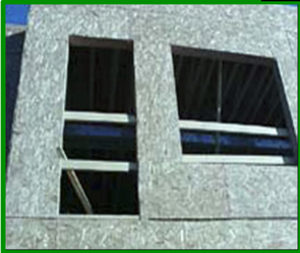
Simple guardrails to prevent falls through window and door openings